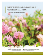
Menopause and Indigenous women in Canada: The State of Current Research