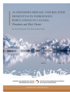
Alzheimer's Disease and Related Dementias in Indigenous populations in Canada: Prevalence and Risk Factors

Two 2018 reports from the National Collaborating Centre for Aboriginal Health (NCCA) share important information about these two health topics.