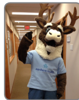
Burns Lake Lakes District Hospital Vacant 250-692-2474

Speak with a health care provider for a referral or contact your local APL directly.