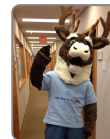
Smithers Dze L'Kant Friendship Centre & Bulkley Valley District Hospital Vacant 250-847-5211 ext. 214