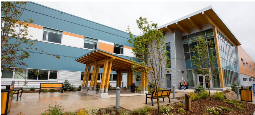
Lakes District Hospital and Health Centre