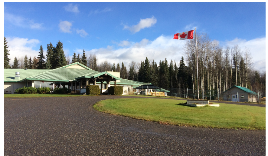
The Pines long-term care facility in Burns Lake.

The facility is located across the street from the Lakes District Hospital and Health Centre. Shopping and other amenities are located nearby in downtown Burns Lake. Residents have access to senior's transportation on Tuesday and Thursday.