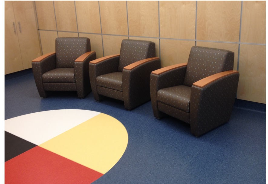
Lakes District Hospital and Health Centre Sacred Space.