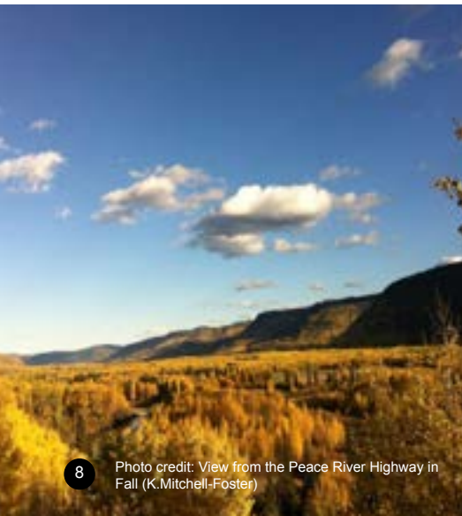
View from the Peace River Highway in Fall